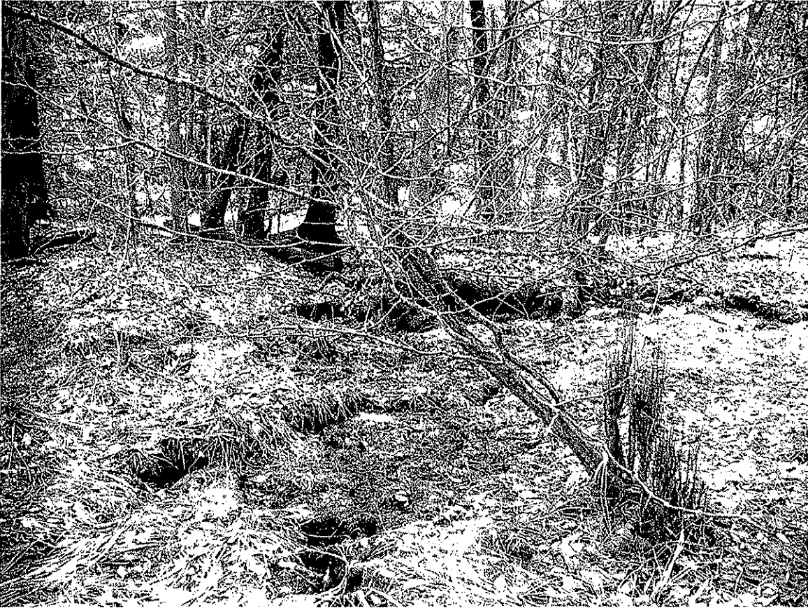
Drainage leading to wetland ((Road layout for 7-20 to 7-22))