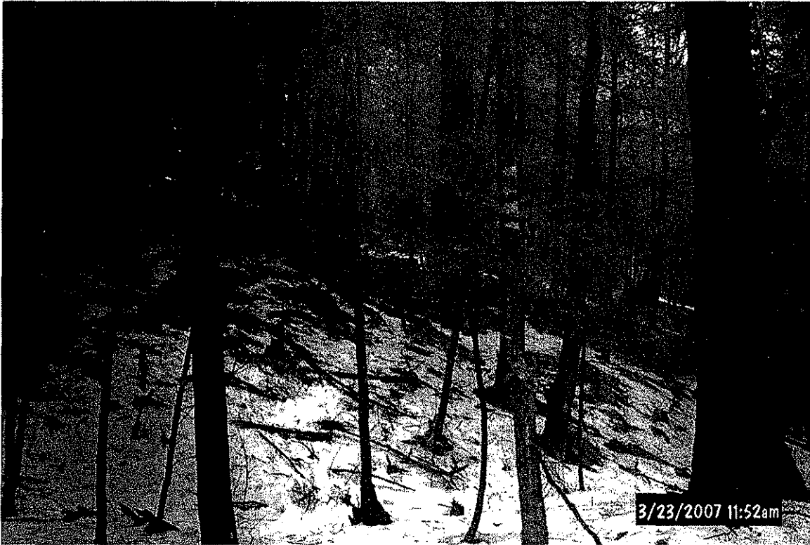
Steep side slope near proposed crossing of Rock Run