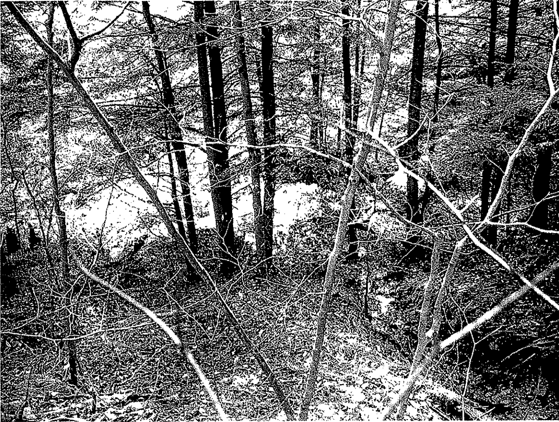
Picture of wetland from bank above well 7-22, looking towards SR 948