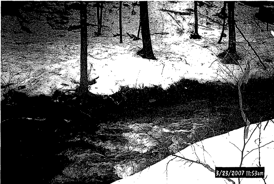
Second proposed crossing of Rock Run