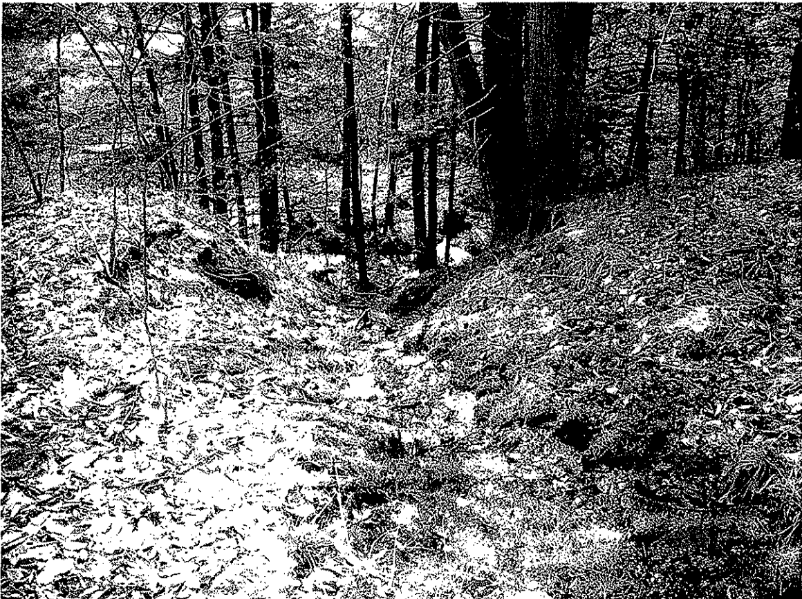
Drainage leading to wetland ((Road Layout for 7-20 to 7-22))