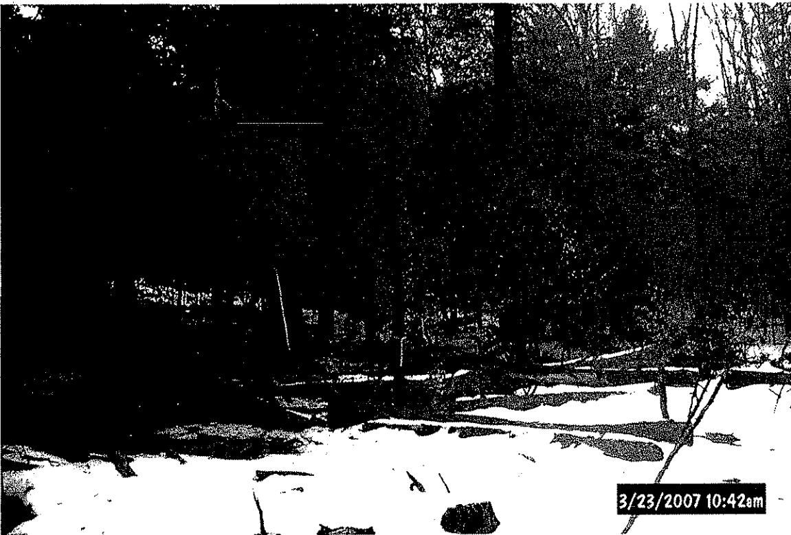
View of well site 7-18 from North Country National Scenic Trail