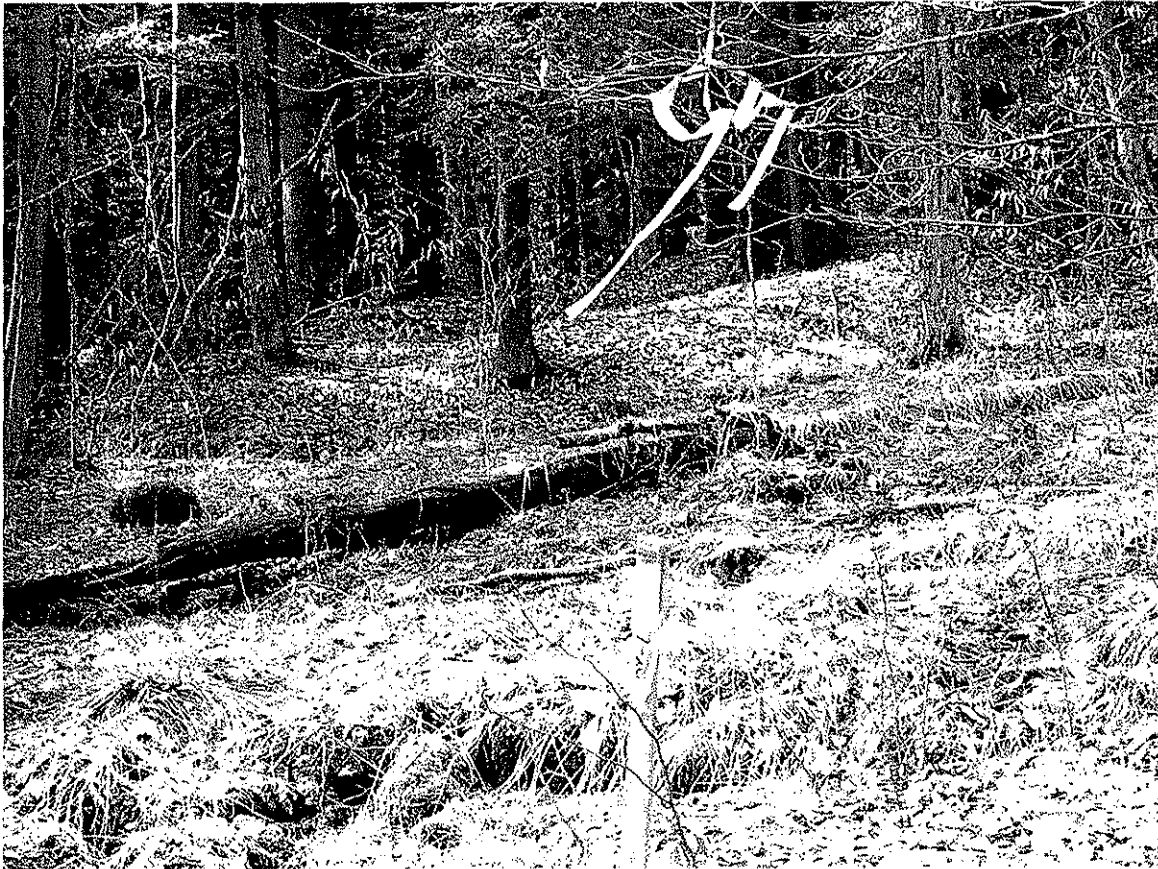
Well Site 7-20 Large Seep