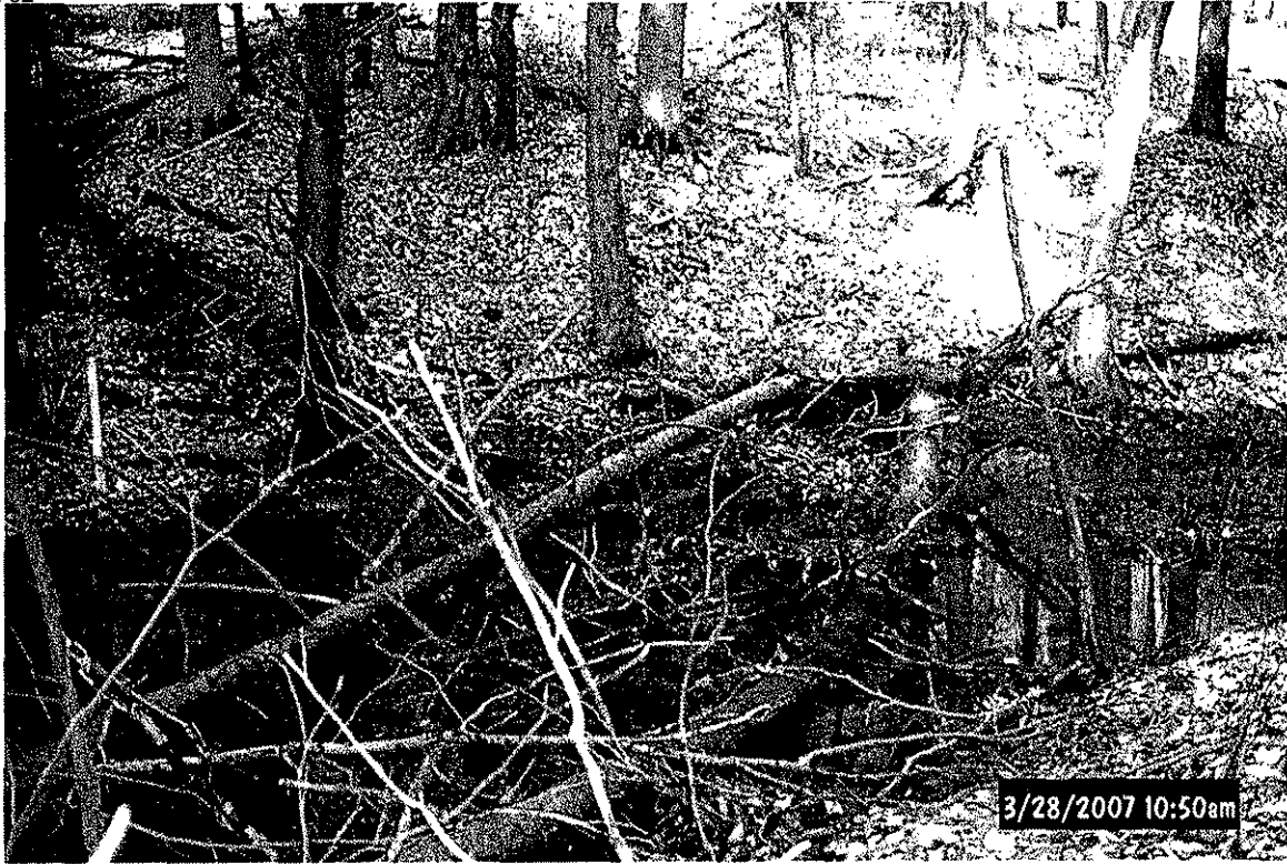
Well Site 7-22