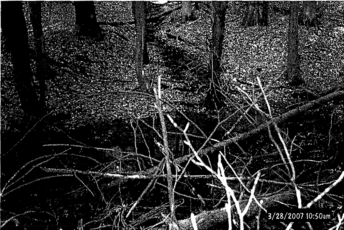
Well Site 7-22. Seep draining into wetland