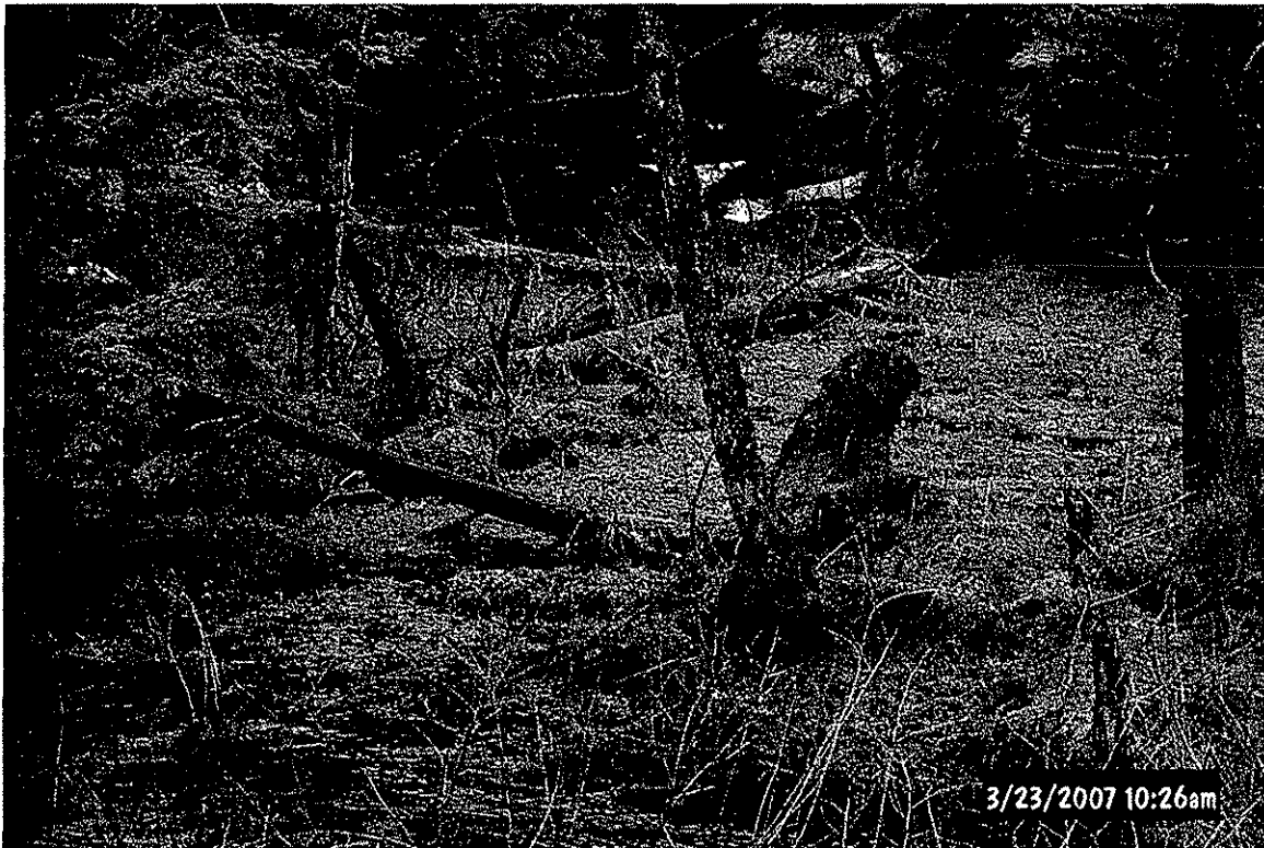
Wetland adjacent to SR 948.