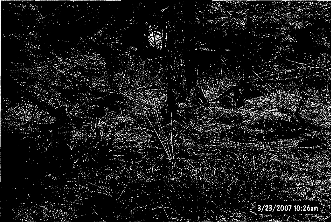
Wetland adjacent to SR 948, looking upslope towards well sites 7-20 & 7-22