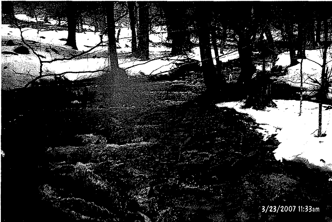
Proposed Crossing of Rock Run for access to wells D-25 to D-27