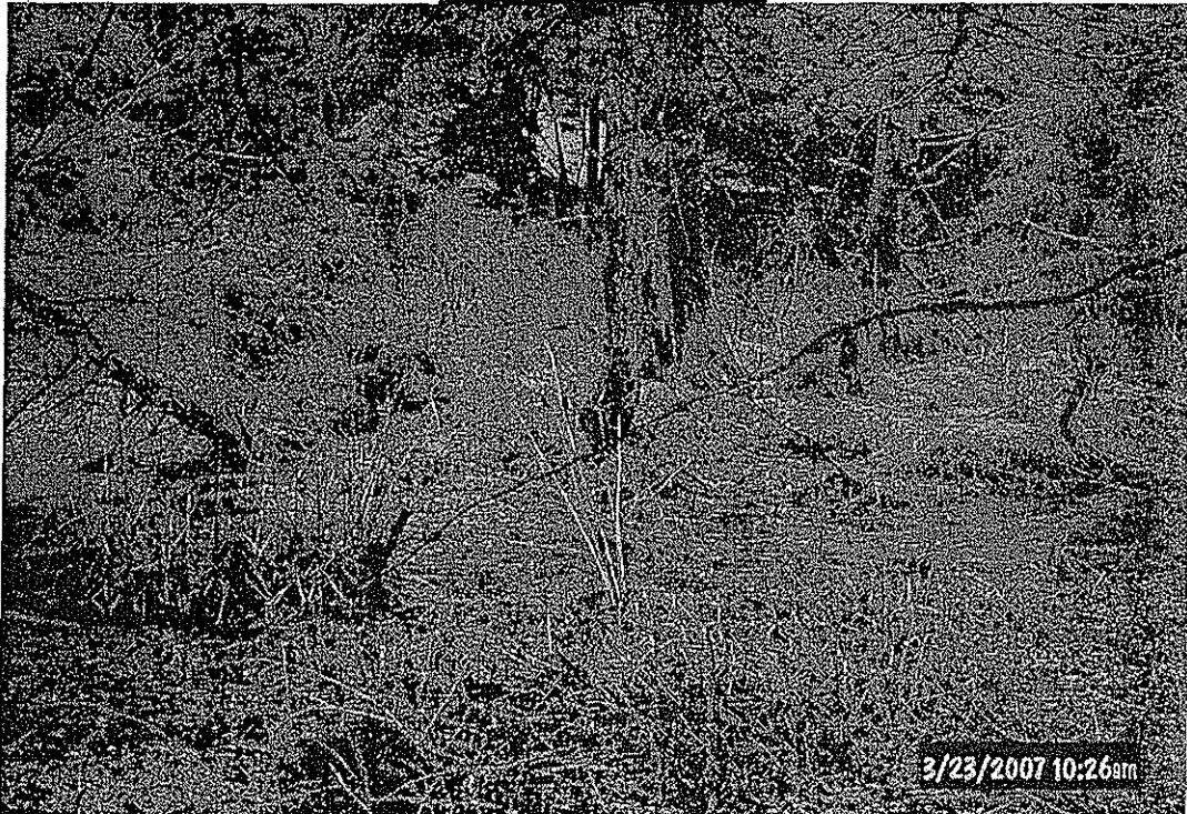
Wetland adjacent to SR 948, looking upslope towards well sites 7-20 & 7-22