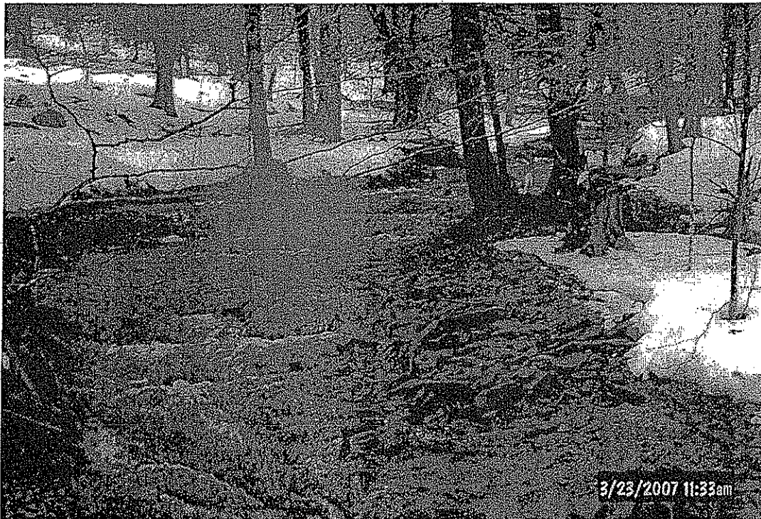
Rock Run near proposed stream crossing for wells D-25 to D-27