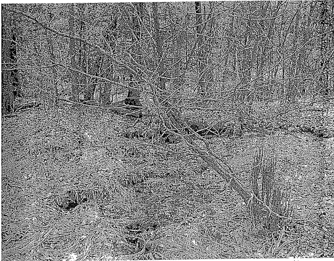
Drainage leading to wetland ((Road layout for 7-20 to 7-22))