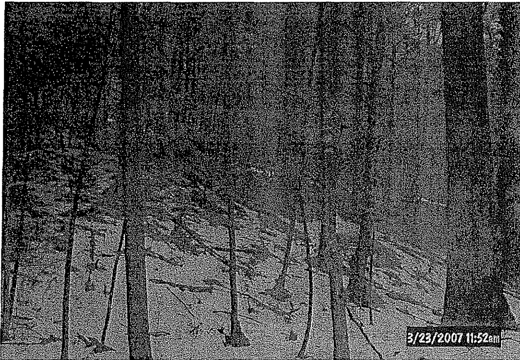
Steep side slope near proposed crossing of Rock Run