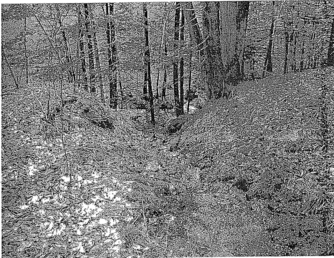
Drainage leading to wetland ((Road Layout for 7-20 to 7-22))