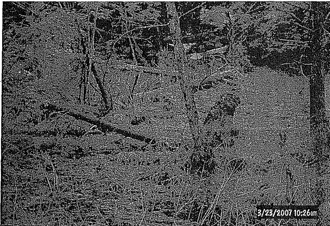
Wetland adjacent to SR 948.