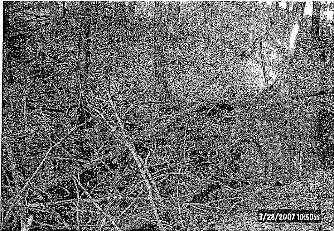
Well Site 7-22