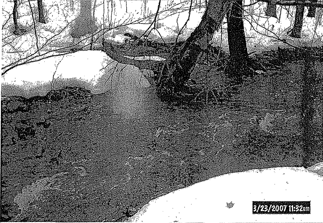
Proposed Crossing of Rock Run for access to wells D-25 to D-27