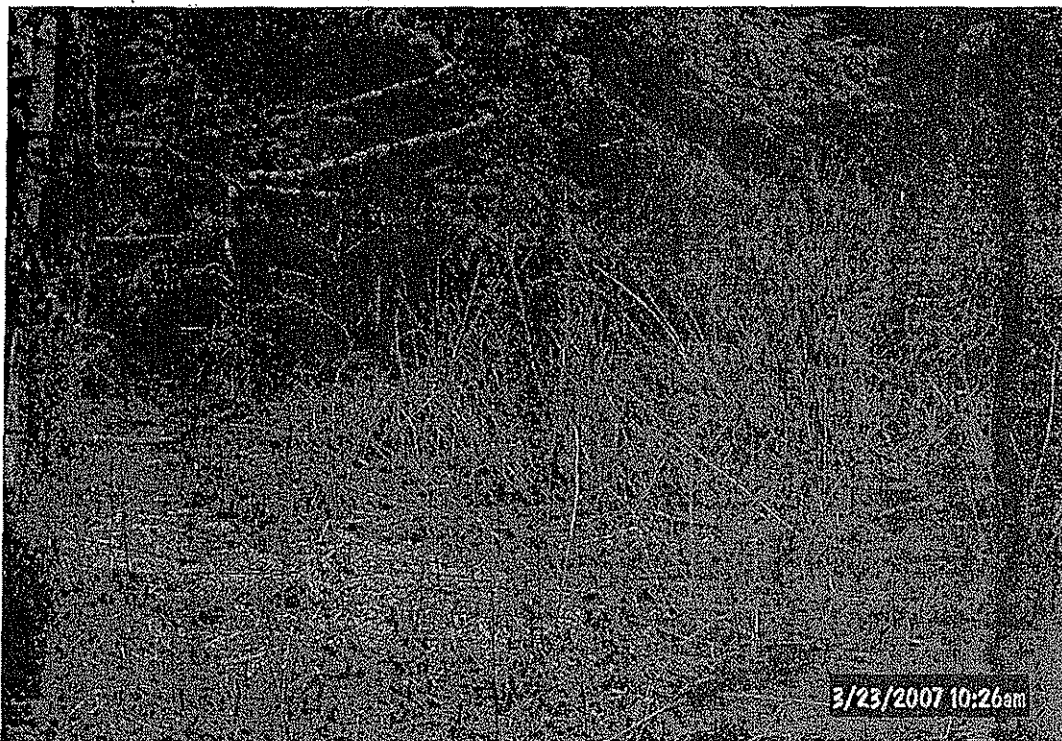
Wetland adjacent to SR 948