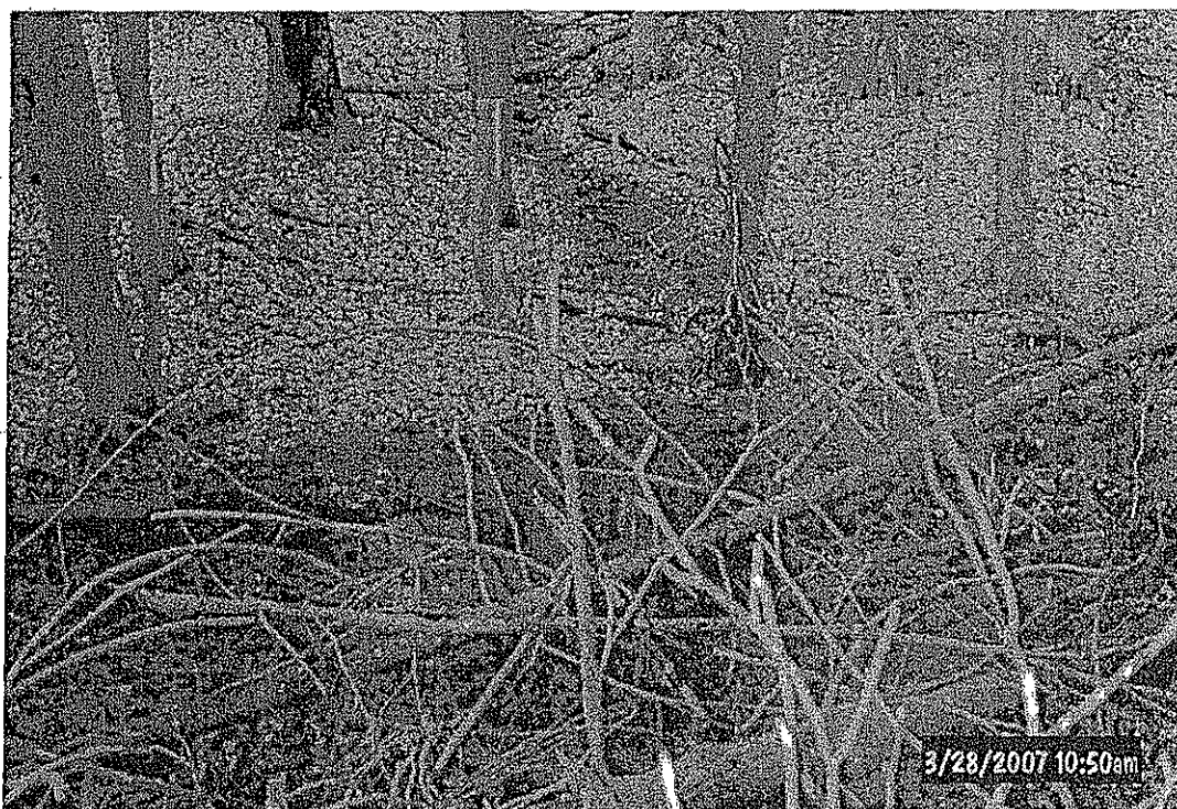
Well Site 7-22 Seep draining into wetland