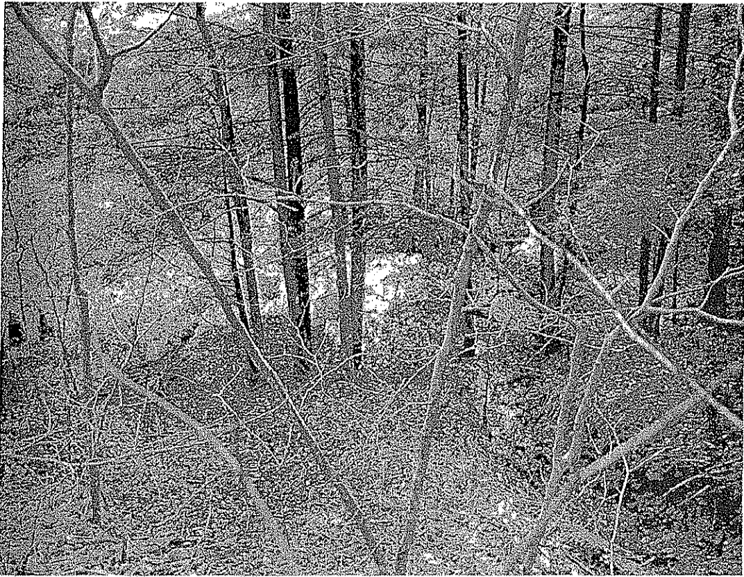
Picture of wetland from bank above well 7-22, looking towards SR 948