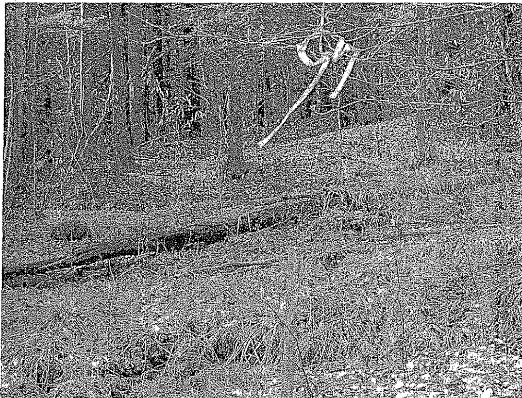
Well Site 7-20 Large Seep