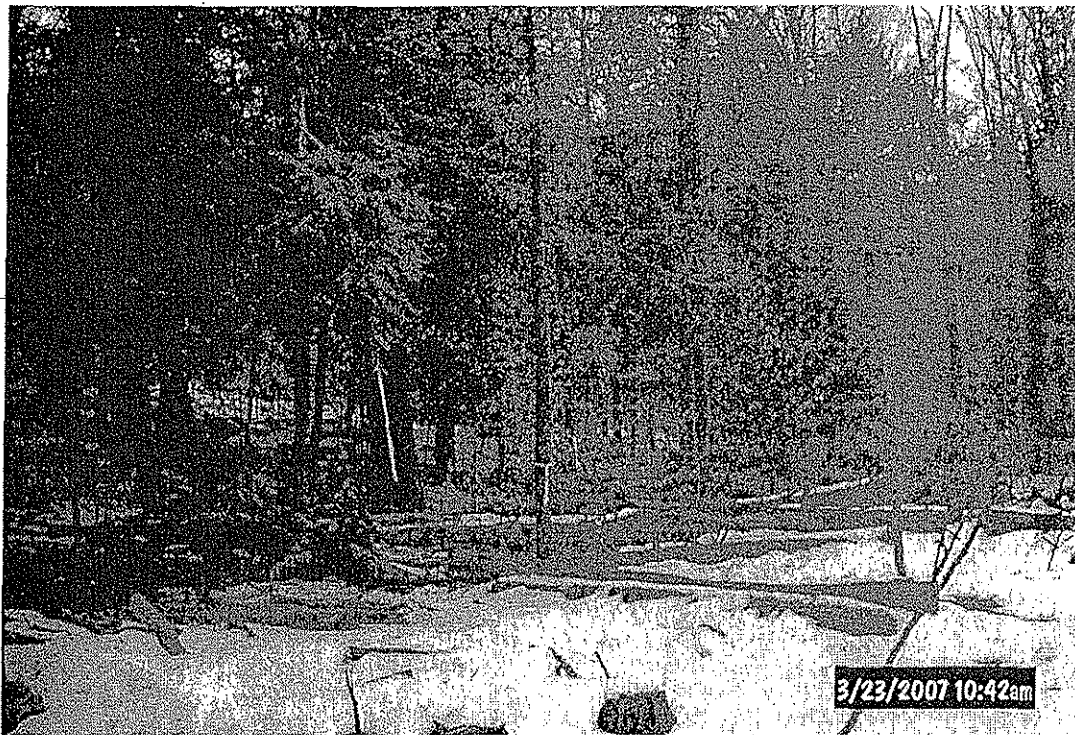
View of well site 7-18 from North Country National Scenic Trail