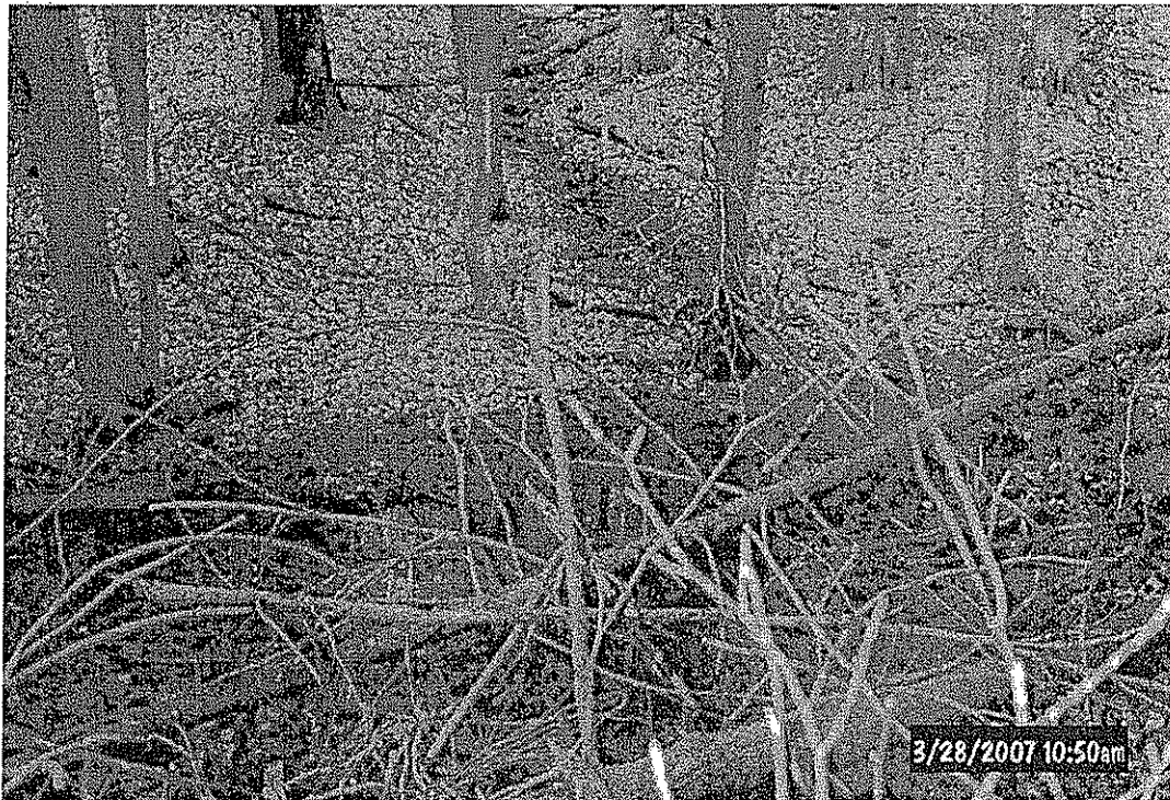
Well Site 7-22 Seep draining into wetland