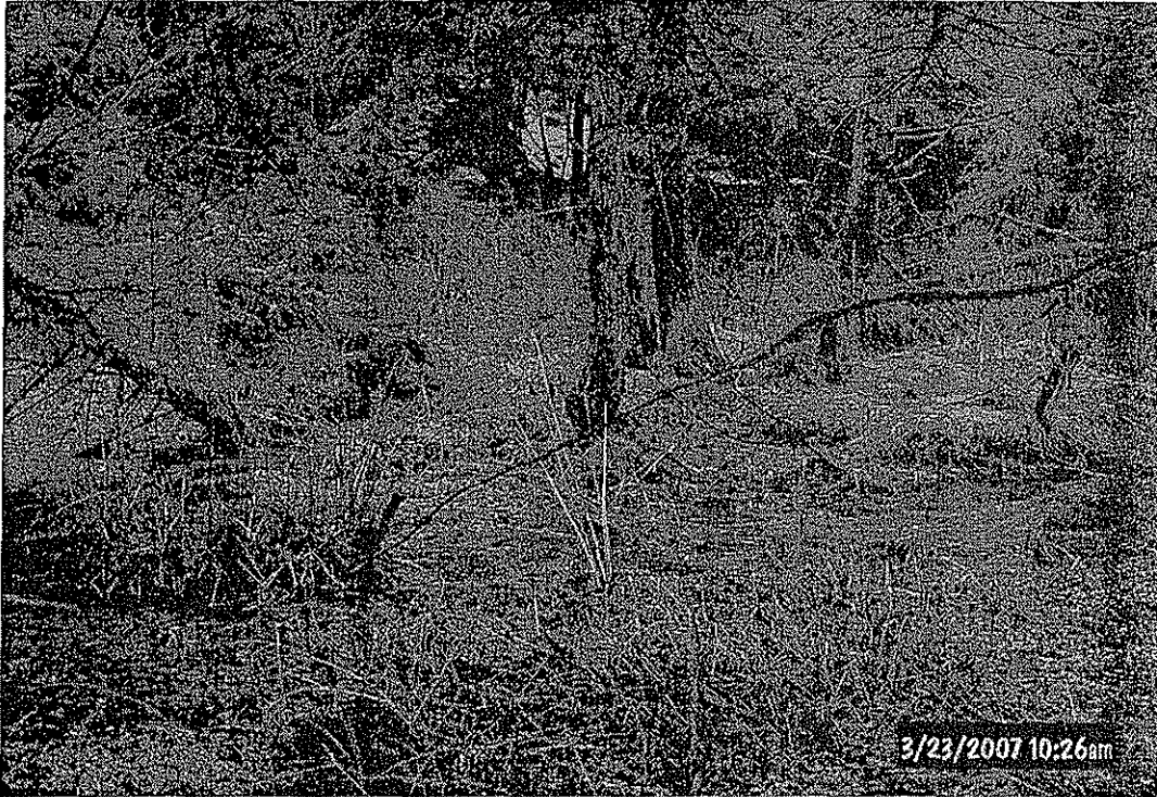
Wetland adjacent to SR 948, looking upslope towards well sites 7-20 & 7-22