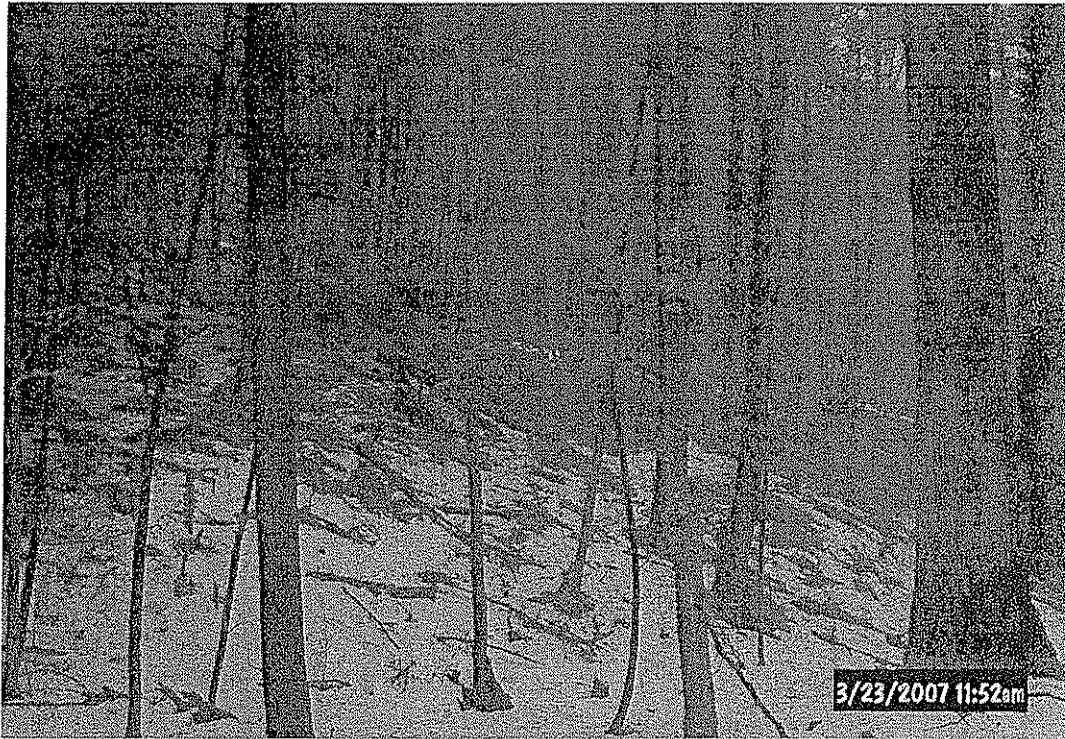
Steep side slope near proposed crossing of Rock Run