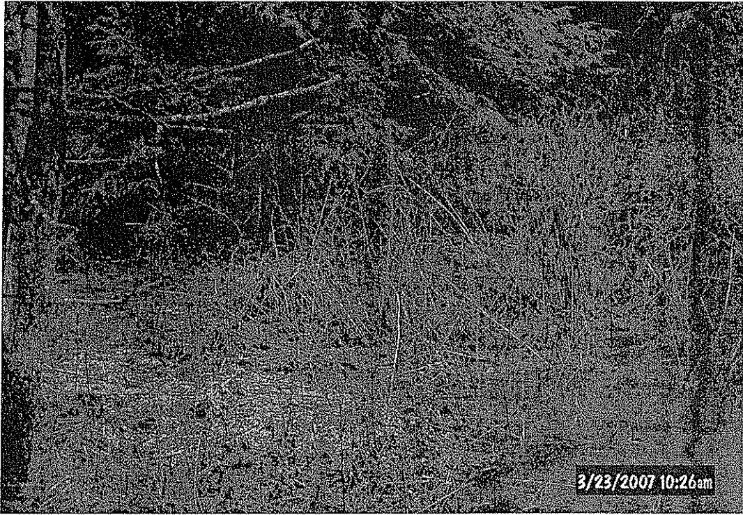
Wetland adjacent to SR 948