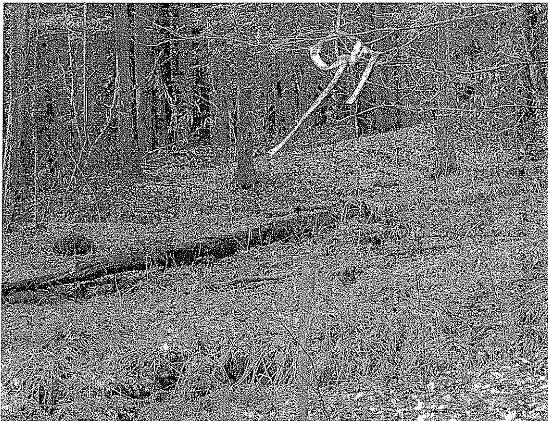
Well Site 7-20 Large Seep