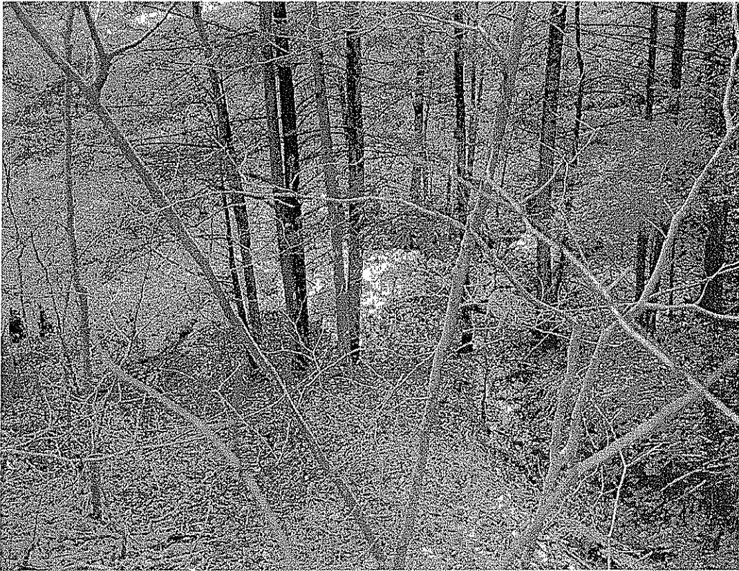
Picture of wetland from bank above well 7-22, looking towards SR 948