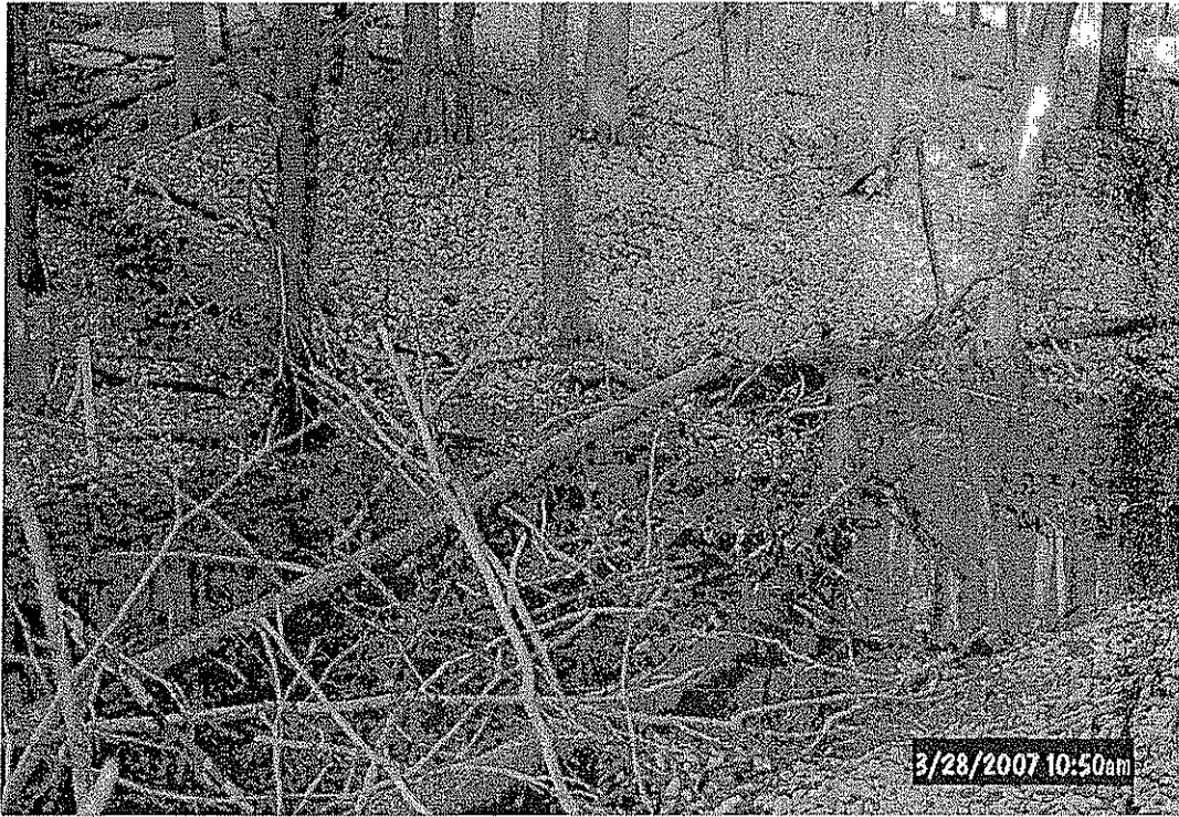
Well Site 7-22