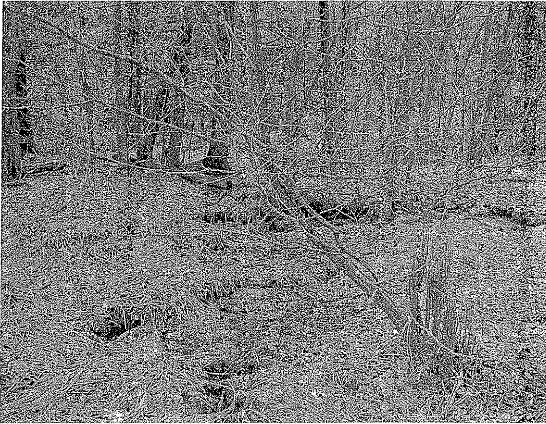
Drainage leading to wetland ((Road layout for 7-20 to 7-22))