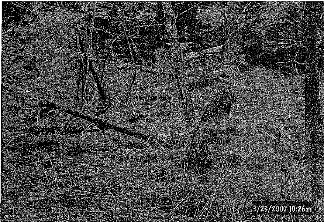
Wetland adjacent to SR 948.