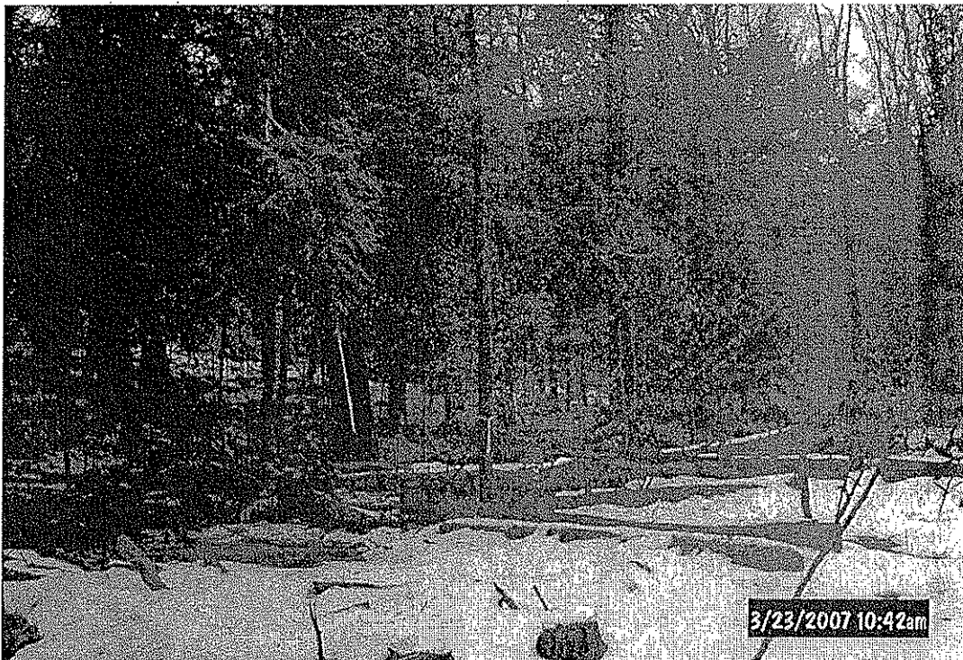
View of well site 7-18 from North Country National Scenic Trail