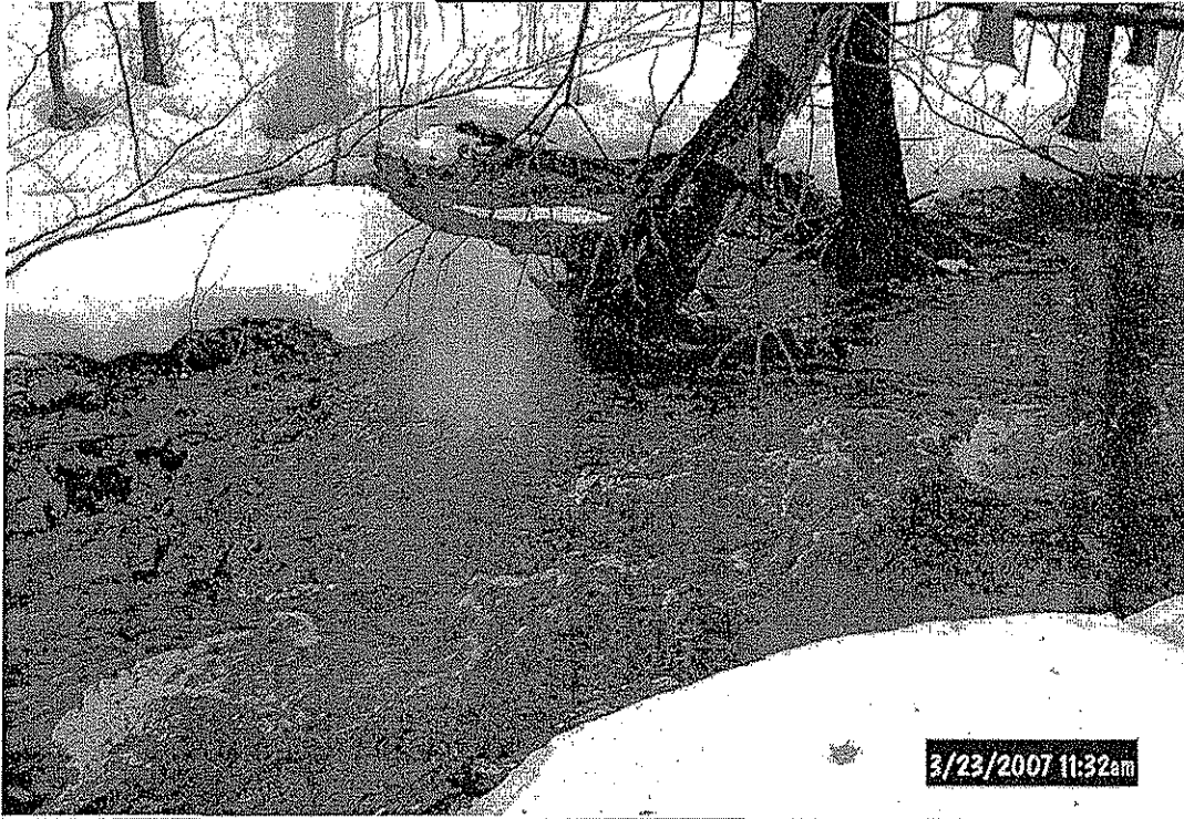
Proposed Crossing of Rock Run for access to wells D-25 to D-27