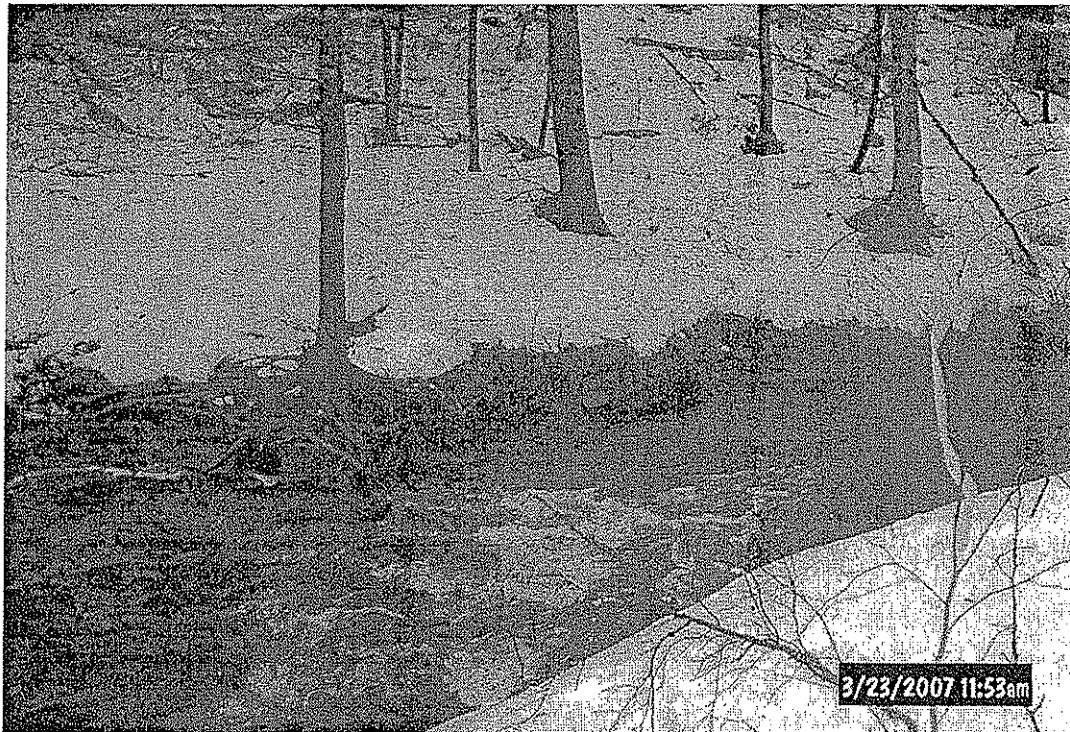
Second proposed crossing of Rock Run