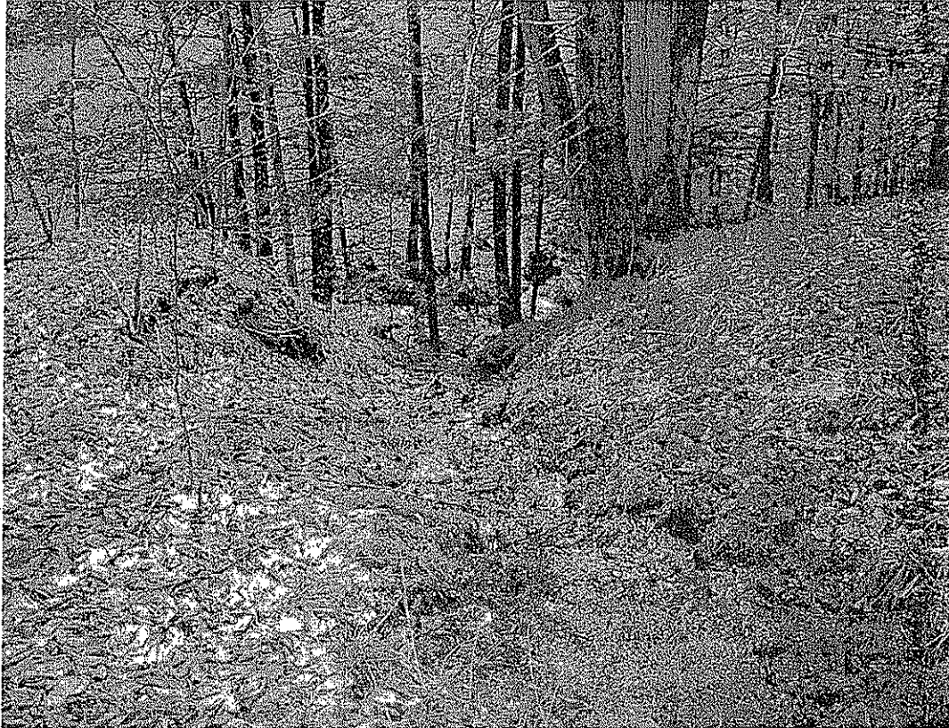
Drainage leading to wetland ((Road Layout for 7-20 to 7-22))