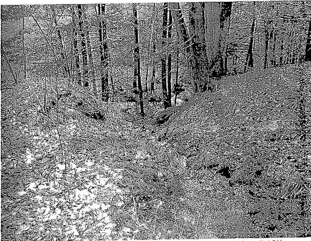
Drainage leading to wetland ((Road Layout for 7-20 to 7-22))