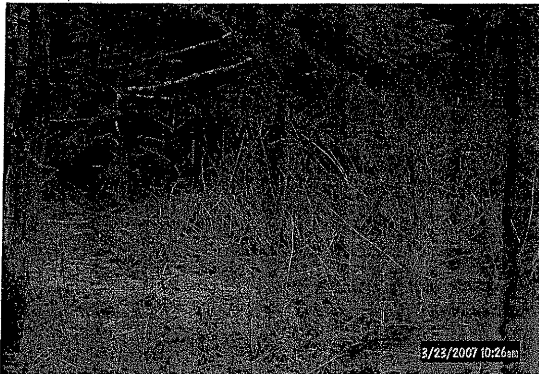
Wetland adjacent to SR 948