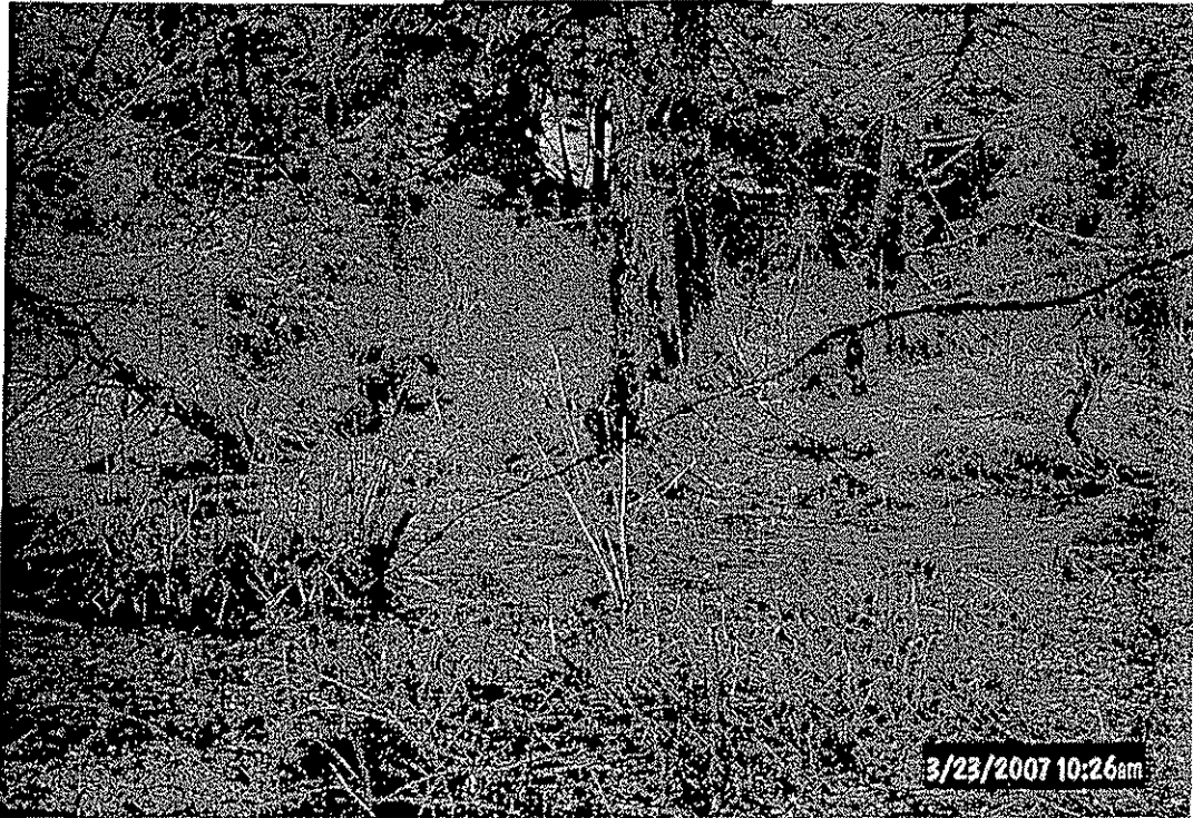
Wetland adjacent to SR 948, looking upslope towards well sites 7-20 & 7-22