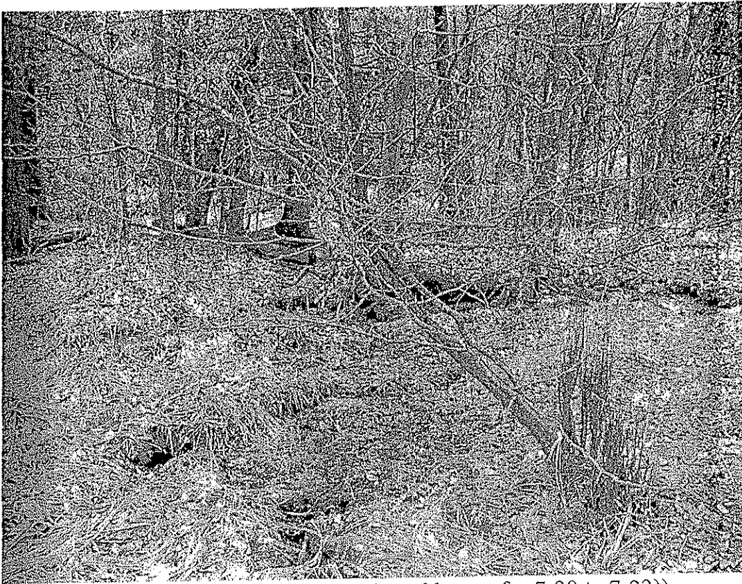
Drainage leading to wetland ((Road layout for 7-20 to 7-22))