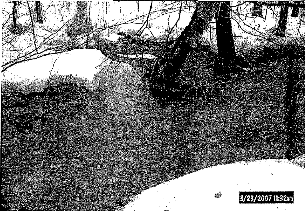
Proposed Crossing of Rock Run for access to wells D-25 to D-27