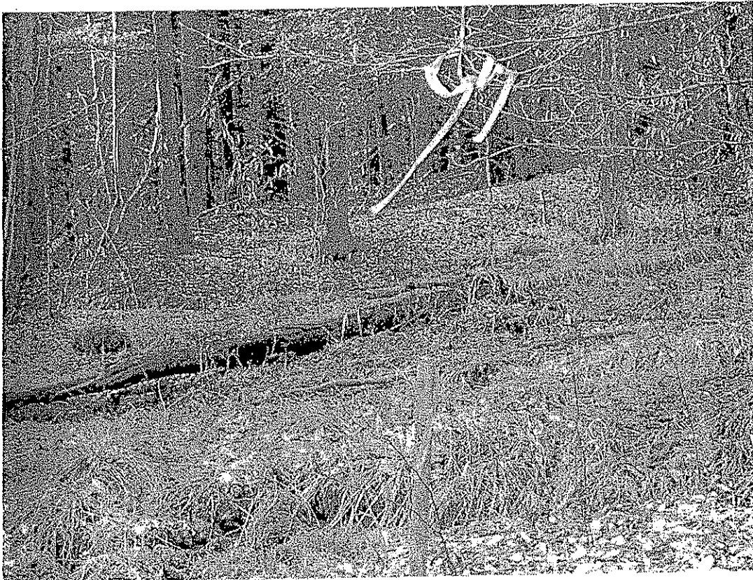
Well Site 7-20 Large Seep