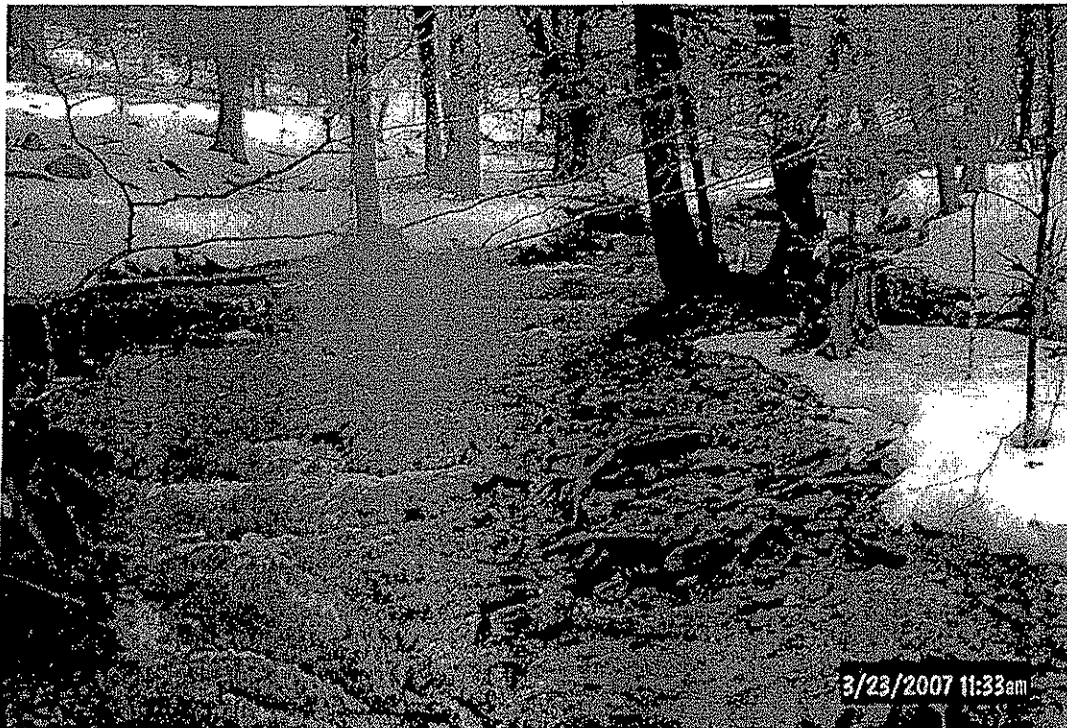
Rock Run near proposed stream crossing for wells D-25 to D-27