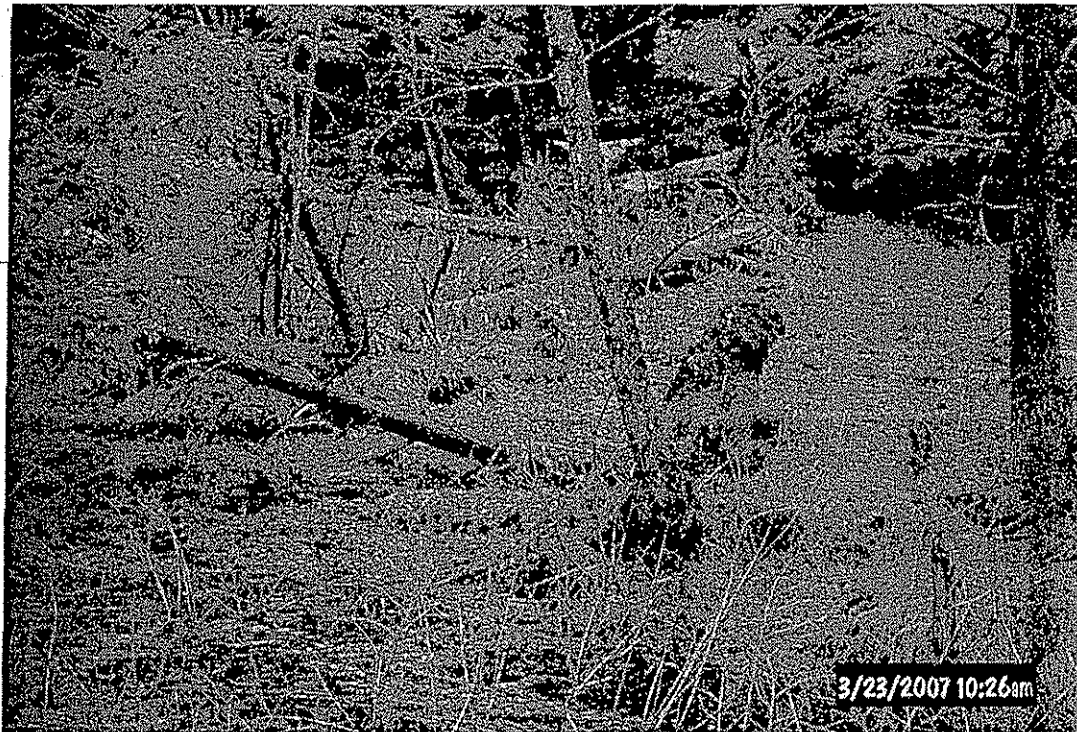
Wetland adjacent to SR 948.