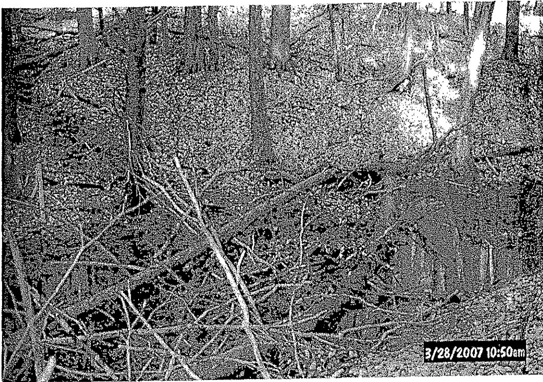
Well Site 7-22