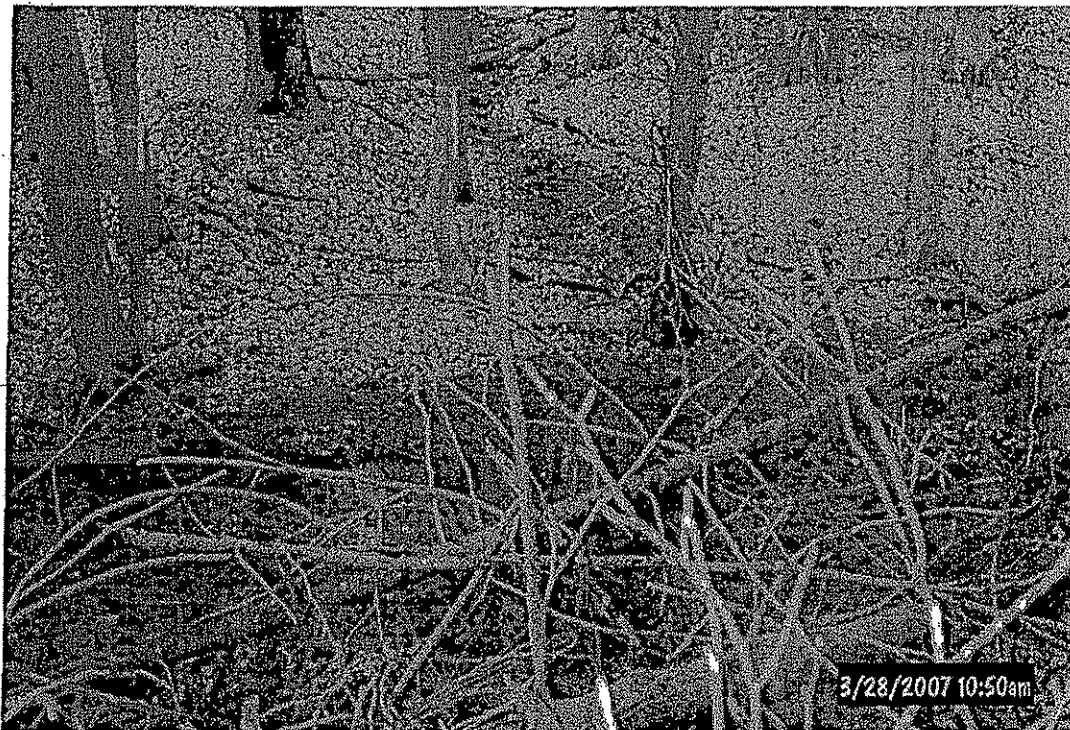
Well Site 7-22 Seep draining into wetland