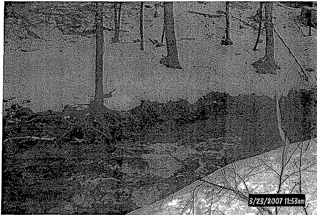
Second proposed crossing of Rock Run