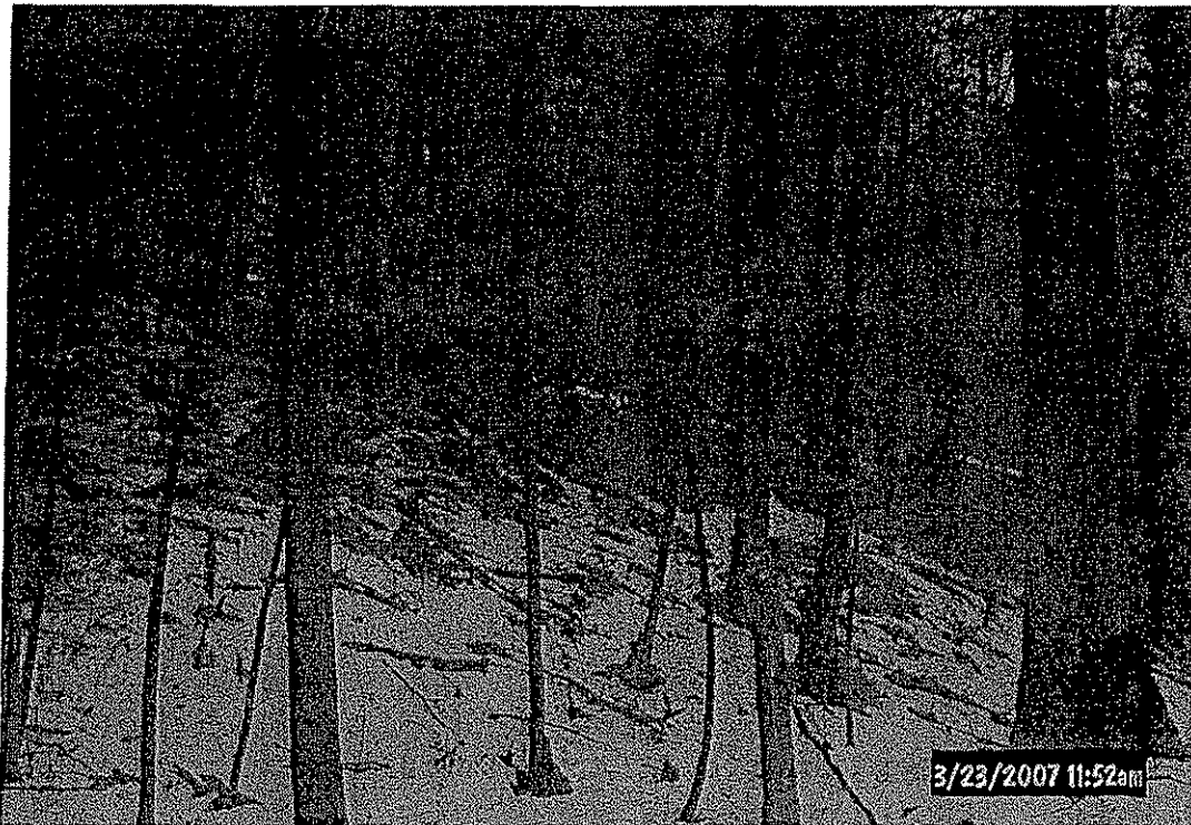
Steep side slope near proposed crossing of Rock Run