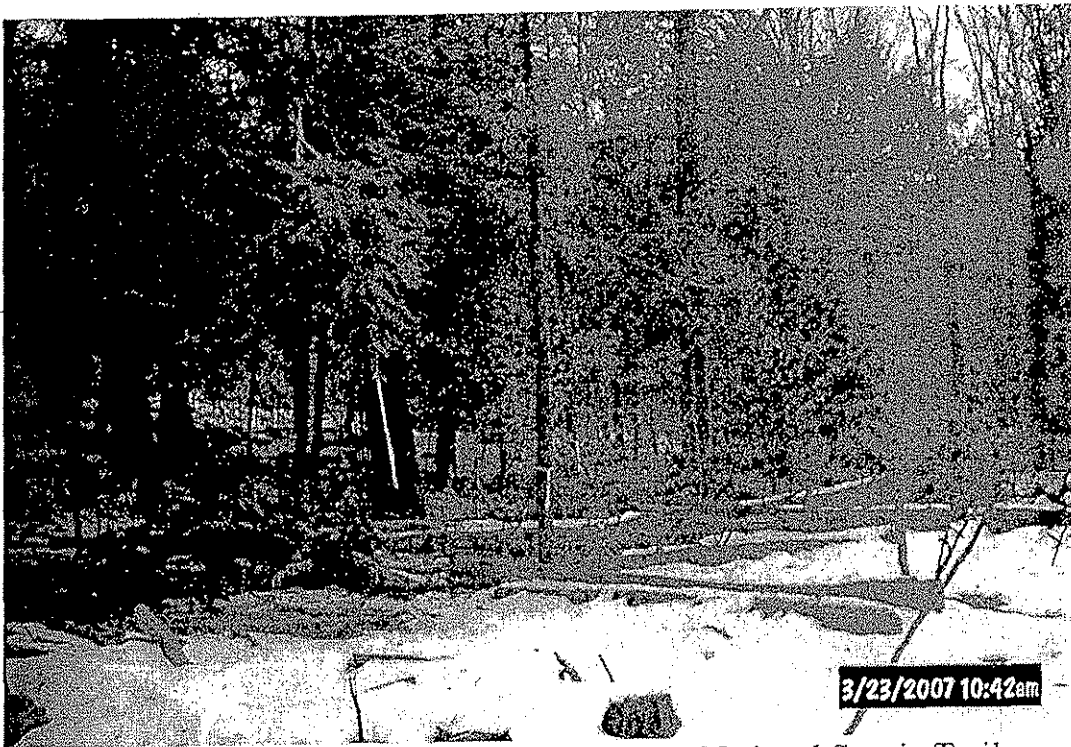
View of well site 7-18 from North Country National Scenic Trail