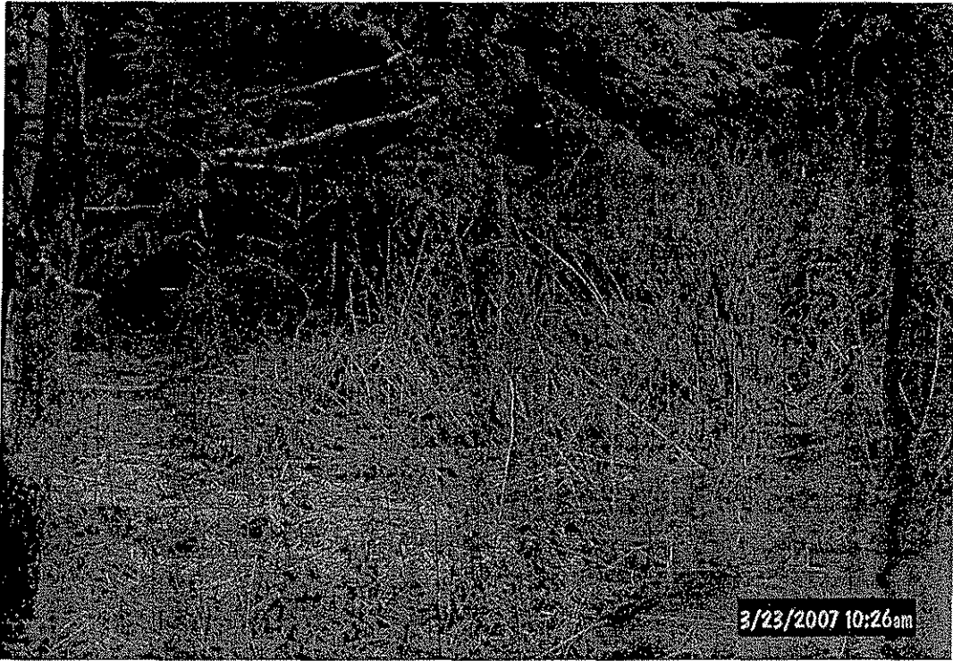
Wetland adjacent to SR 948