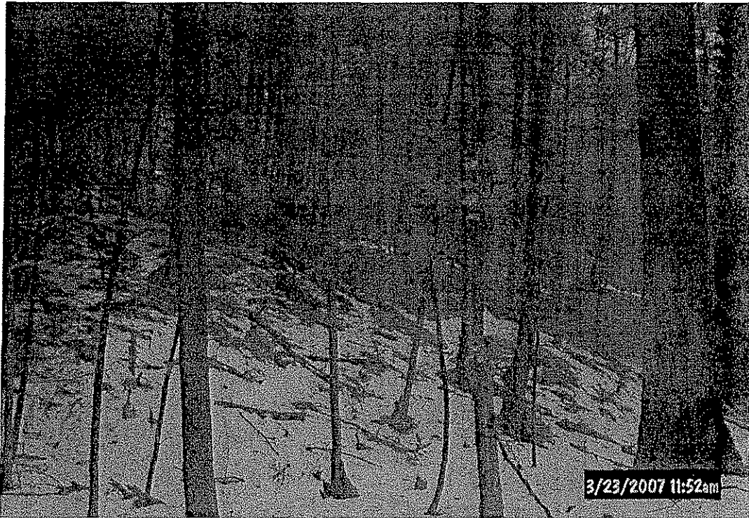
Steep side slope near proposed crossing of Rock Run