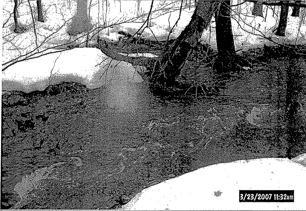
Proposed Crossing of Rock Run for access to wells D-25 to D-27