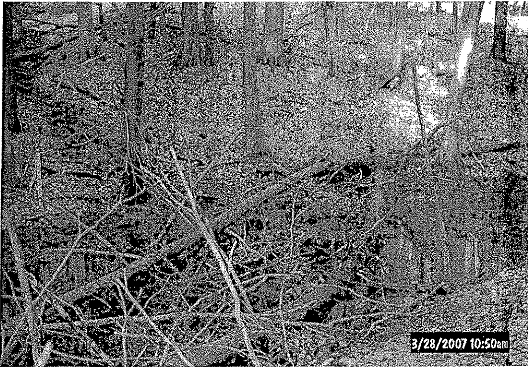
Well Site 7-22