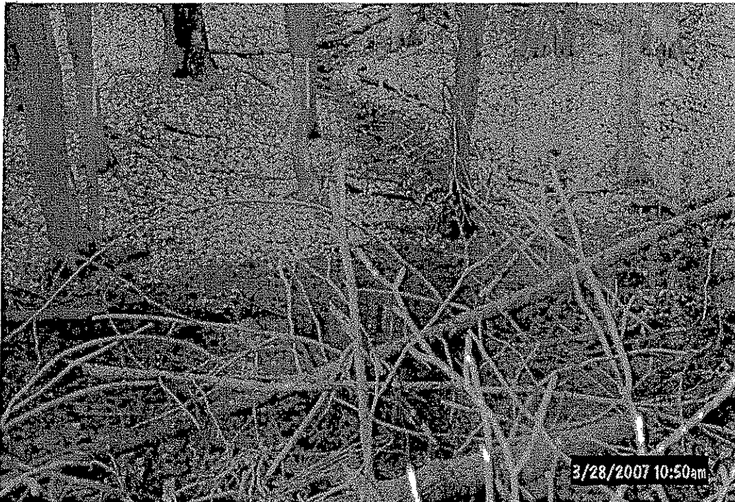
Well Site 7-22 Seep draining into wetland