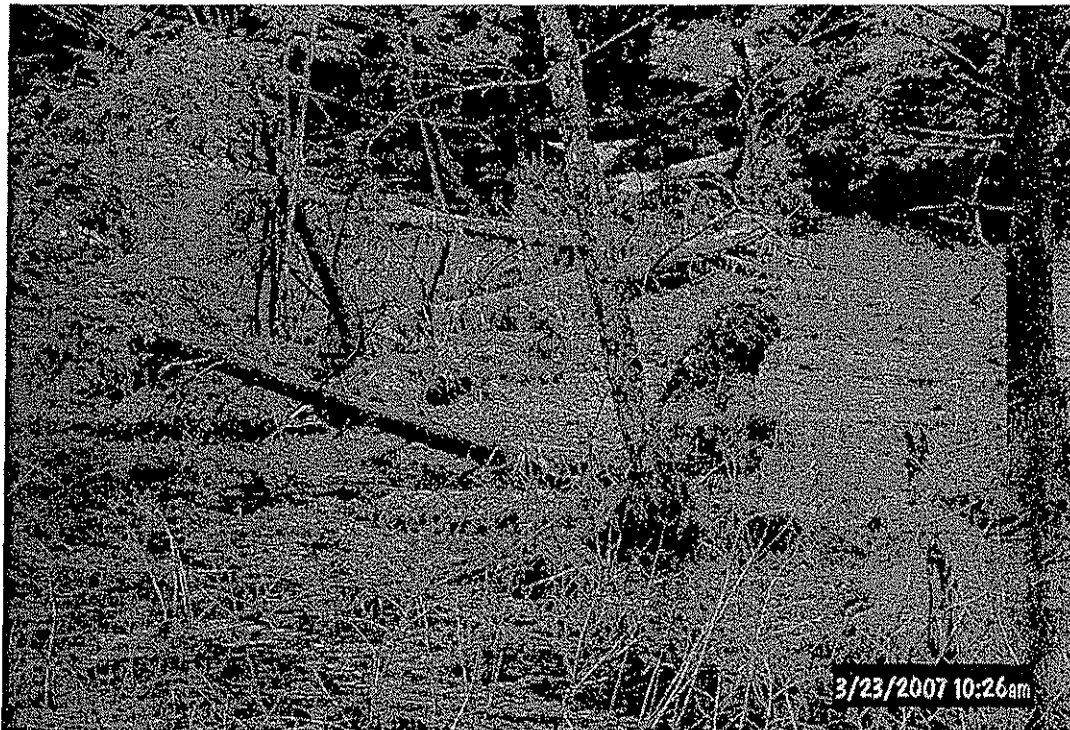
Wetland adjacent to SR 948.