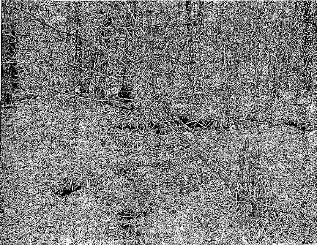
Drainage leading to wetland ((Road layout for 7-20 to 7-22))