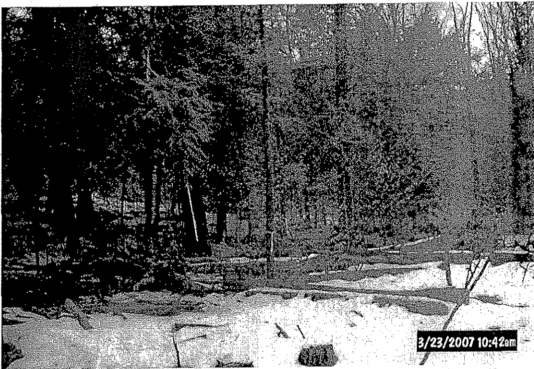
View of well site 7-18 from North Country National Scenic Trail