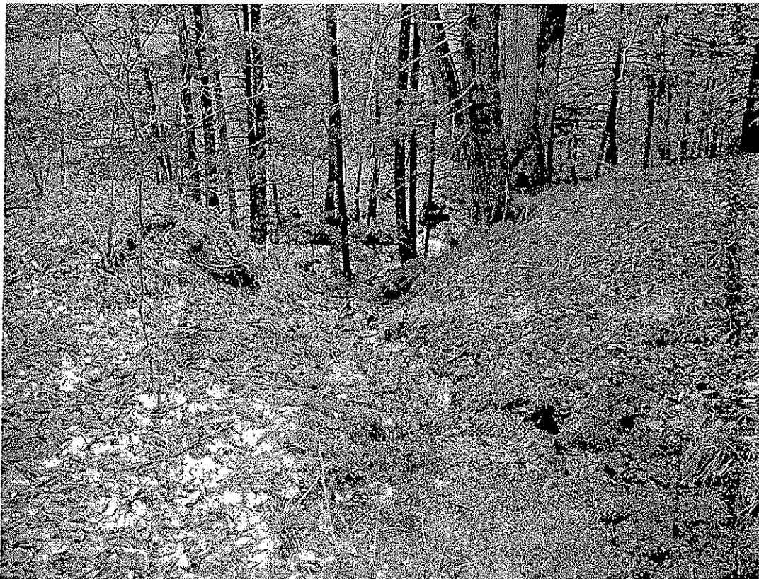
Drainage leading to wetland ((Road Layout for 7-20 to 7-22))