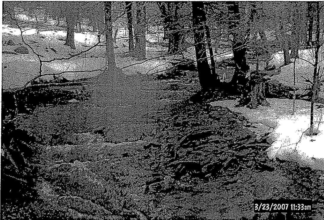
Rock Run near proposed stream crossing for wells D-25 to D-27