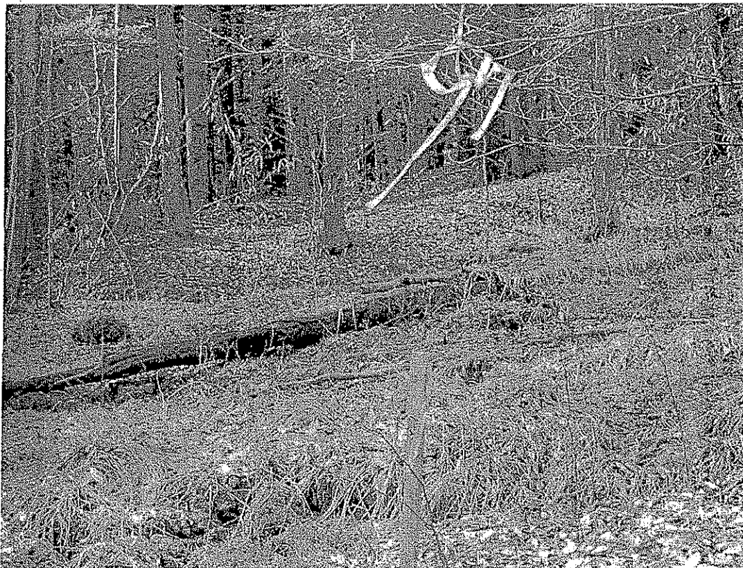
Well Site 7-20 Large Seep