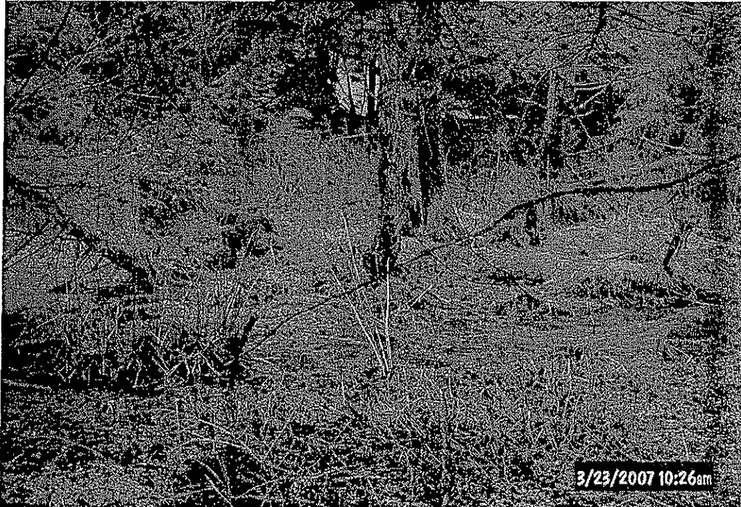
Wetland adjacent to SR 948, looking upslope towards well sites 7-20 & 7-22